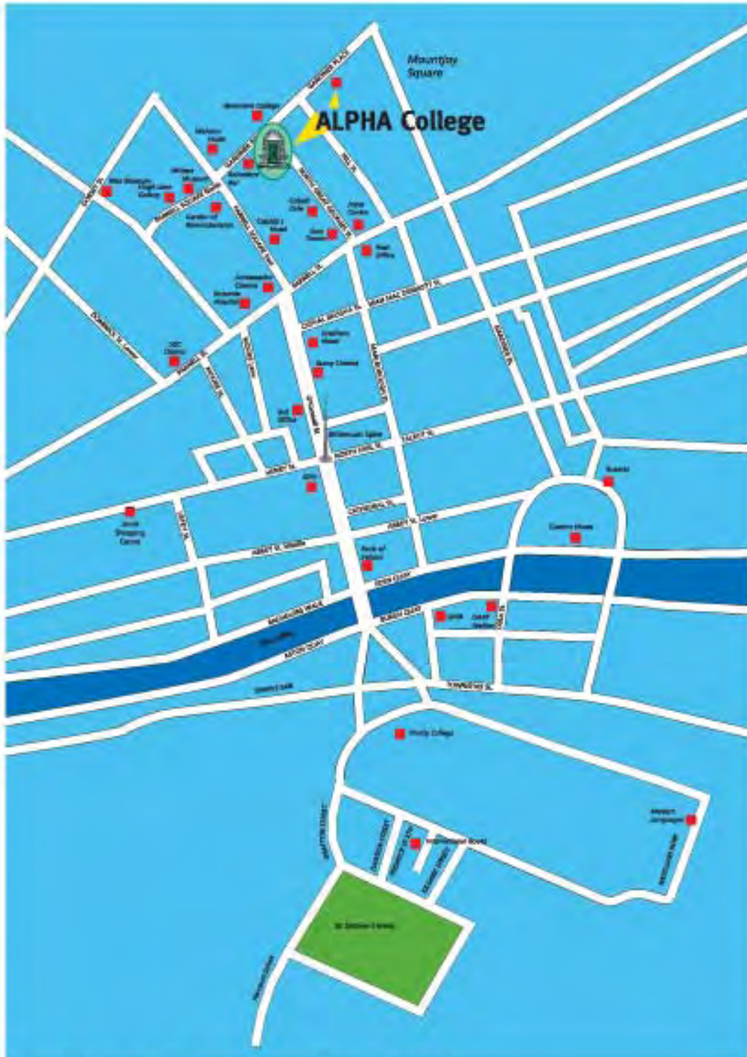
Dublin City Centre Map