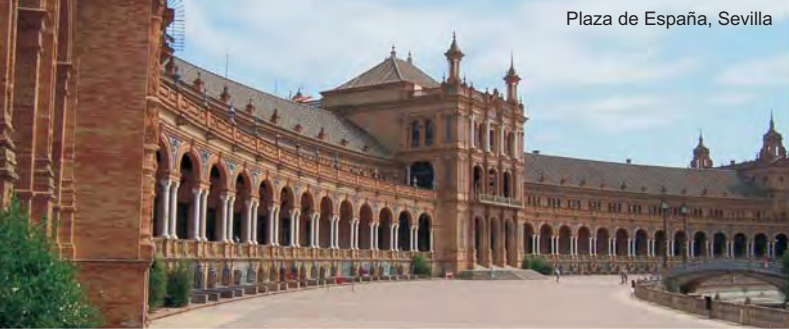
Plaza de España, Sevilla