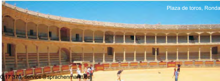
Plaza de toros, Ronda