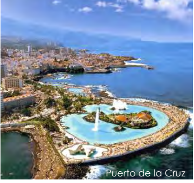
Puerto de la Cruz

The Golden Age program is available in Puerto de la Cruz, an upmarket town located in the northern part of Tenerife, the best-known of Spain's Canary Islands. With its leafy plaza, relaxed atmosphere and wonderful weather, it is the perfect place to study Spanish at any time of year. In addition, Tenerife's attractions include far more than the 350km of stunning coastline - visitors can enjoy tropical forest walks, lunar landscapes surrounding the Teide volcano, designer shopping and exquisite Canarian cuisine. The famous Martiánez lakes and Parque Loro also comprise some of the numerous jewels in this island's crown.