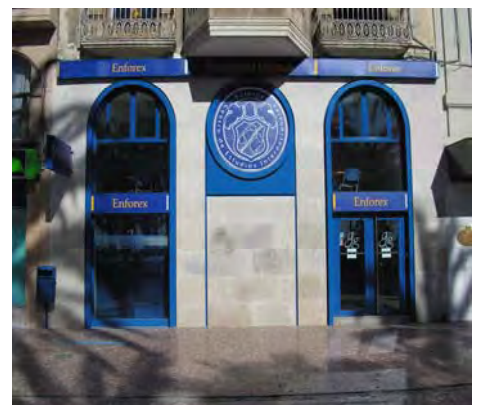
Schule in Alicante