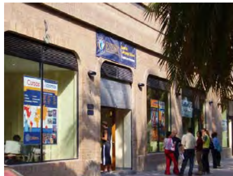
Schule in Valencia

In Alicante verfügt die Schule, die ebenfalls im mediterranen Stil erbaut ist, über acht Klassenzimmer, die genügend Platz für maximal 60 Schüler bieten. Die Sprachschule ist auf dem neuesten Stand in Bezug auf audiovisuelles Lernen. Zum Strand sind es lediglich 2 Minuten.