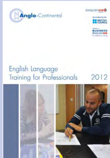
Professional Training Prospectus