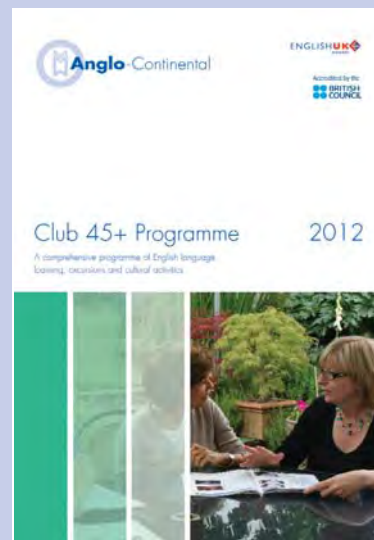
Club 45+ Programme