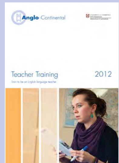
Teacher Training Prospectus