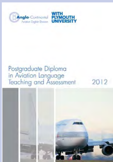
To be introduced in 2012 Postgraduate Diploma in Aviation Language Teaching and Assessment

Member of BUSINESS ENGLISH UK for Professional Training