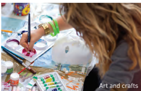
Art and crafts

Students will take part in a selection of supervised activities including other sports and creative arts, allowing them to try new things and take advantage of the many on-site facilities at Wellington College. Evening events take place daily and are a perfect end to the day. Popular events include discos, quiz nights and fashion shows.