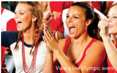
View a live Olympic event

On Bell's Olympic Focus English programme, students enjoy: