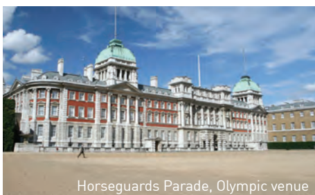
Horsecourts Parade, Olympic venue

The course includes a selection of full and half day visits to UK destinations such as: