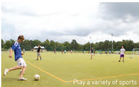
Play a variety of sports

Students have a unique opportunity to explore the Olympic sports, including fencing and table tennis , and develop their skills over the three-week programme. Experienced staff will provide coaching in a range of Olympic sports and assess students at the end of the course. As well as developing practical knowledge and skills, students will also develop their English through the history and vocabulary of the Olympics.