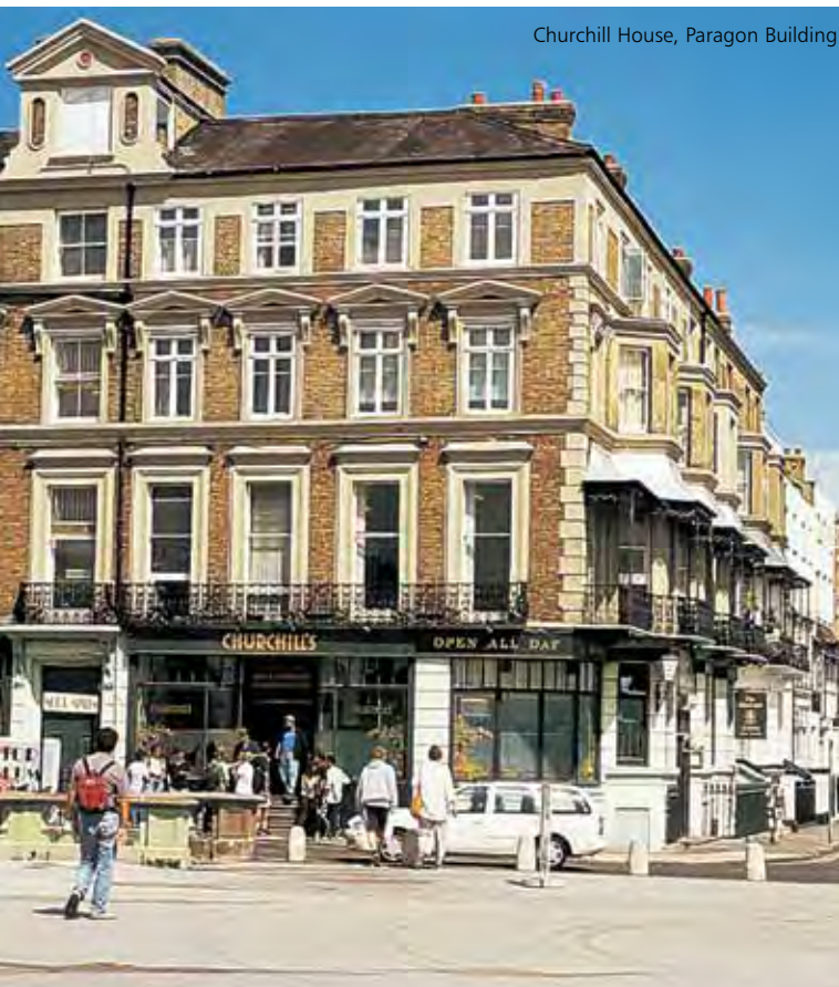
Churchill House, Paragon Building