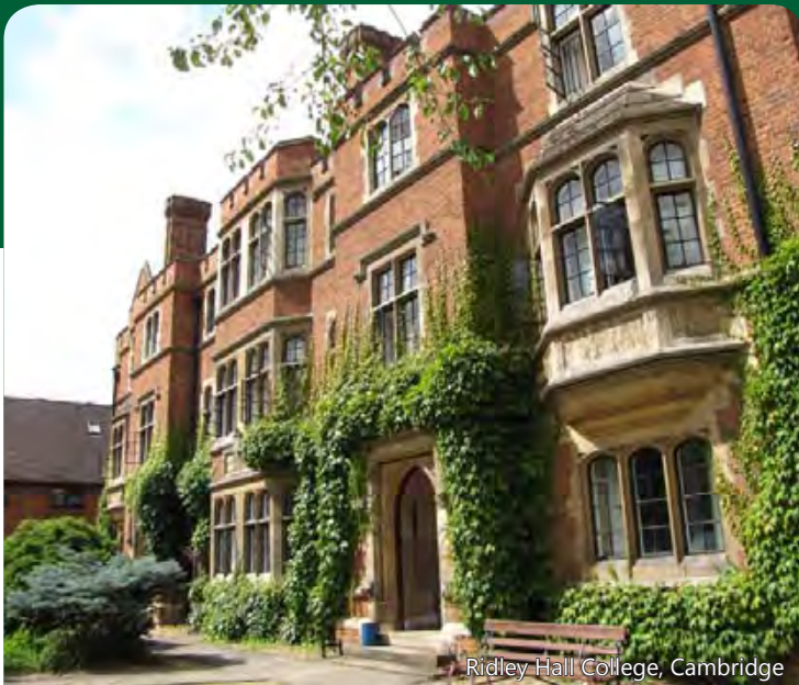
Ridley Hall College, Cambridge