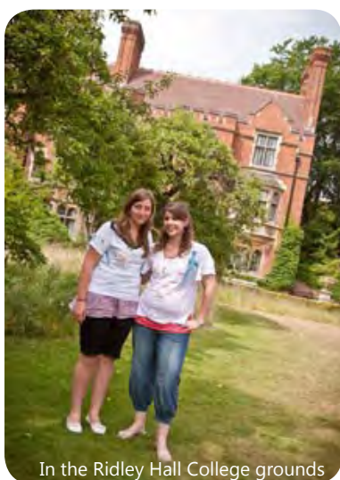
In the Ridley Hall College grounds