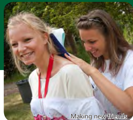
Making new friends