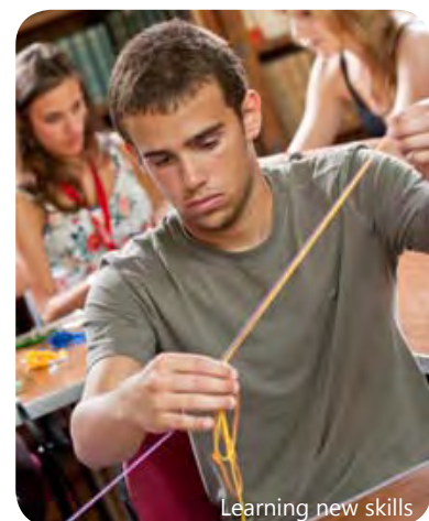
Learning new skills