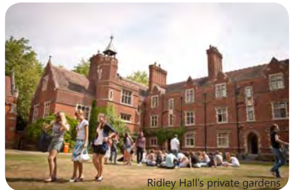
Ridley Hall's private gardens

Studio Cambridge has taught at Ridley Hall every summer for the past 47 years. The Sir Christopher Programme has an international reputation and is one of our most popular programmes.