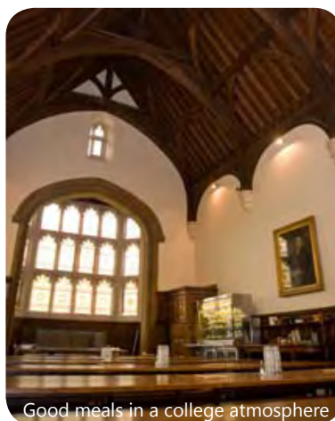
Good meals in a college atmosphere