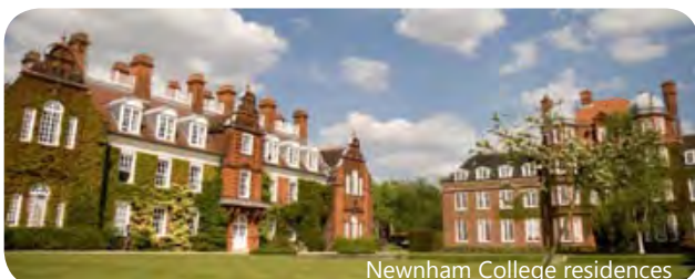
Newnham College residences