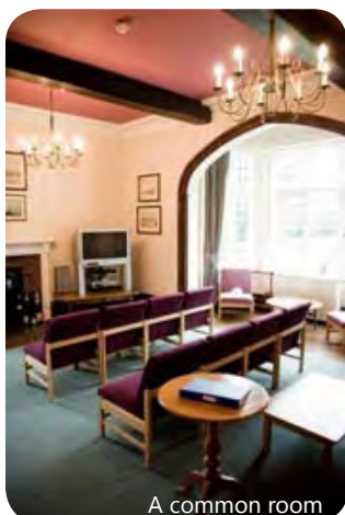
A common room