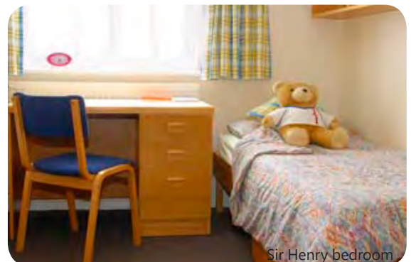
Sir Henry bedroom

We have been running our Sir Henry programme at HAEC every summer for the past 13 years. We take over the entire premises of the college for the months of July and August.