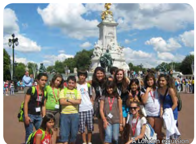
A London excursion