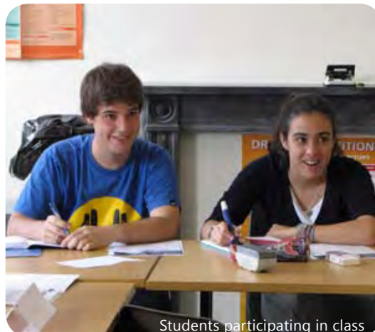
Students participating in class