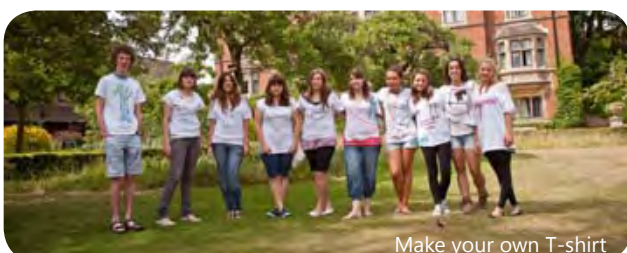
Make your own T-shirt