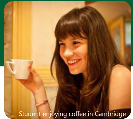
Student enjoying coffee in Cambridge