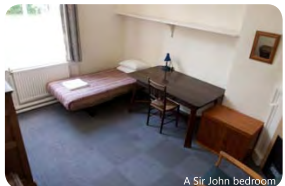
A Sir John bedroom