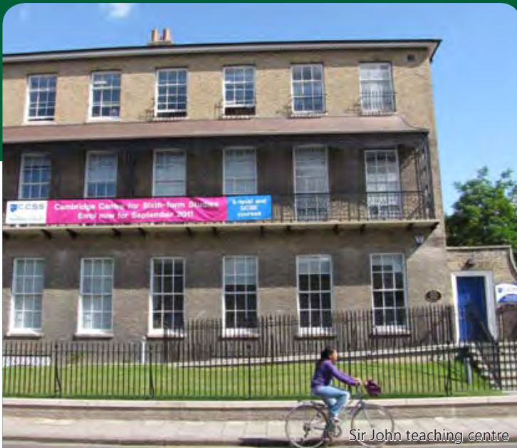
Sir John teaching centre