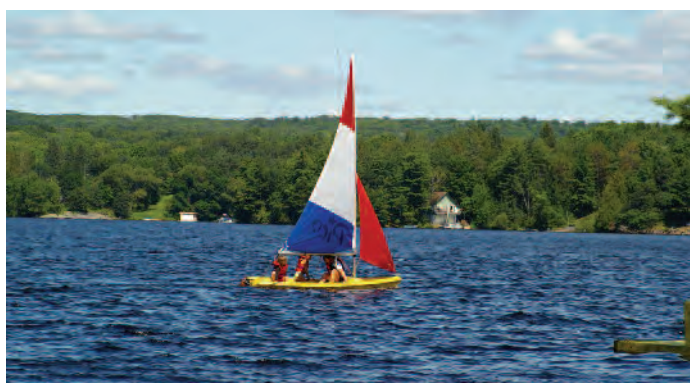
Sailing - one of the exciting activity options

Please note that the camps on these two pages are run by our Canadian partners and are independent from Village Camps