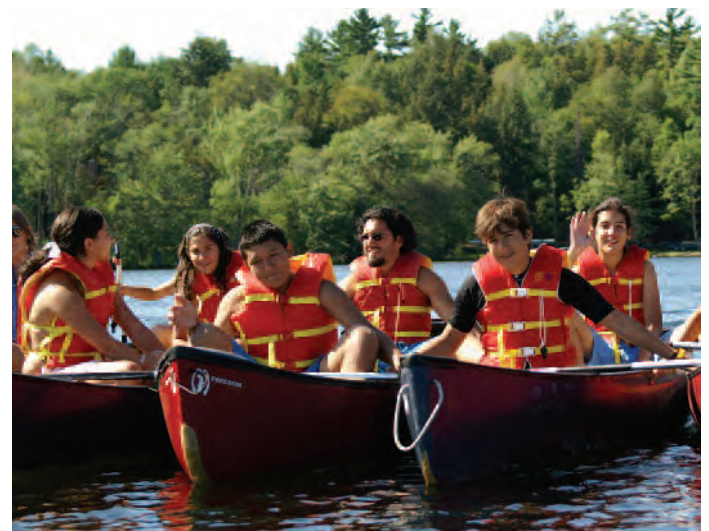
Canoeing on the lakes and rivers of Ontario