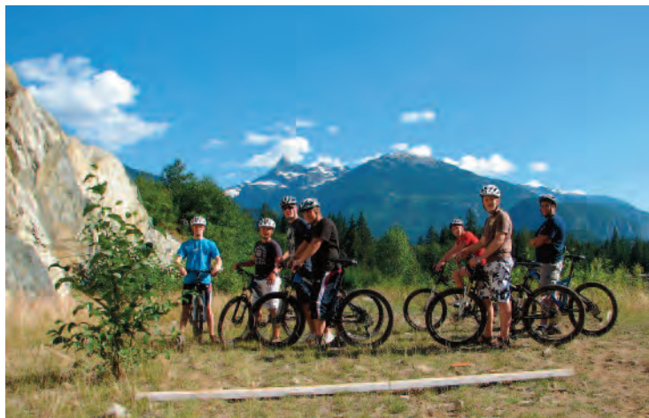
Cycling in British Columbia