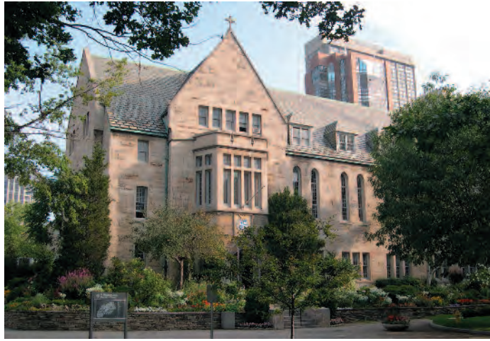
St. Michael's College