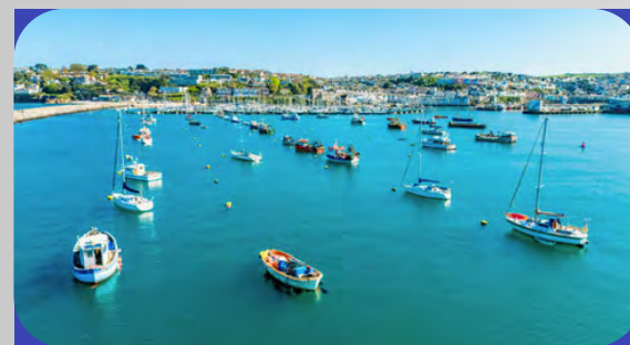
BOAT TRIP TO BRIXHAM