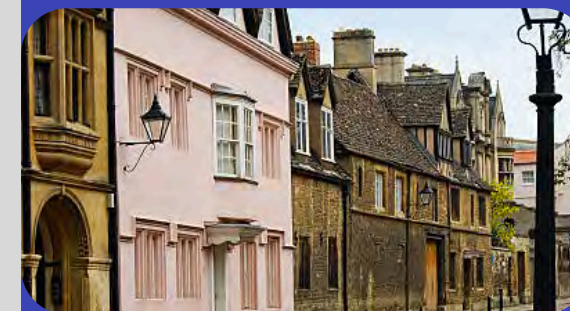
COUNTRY PUB TOUR