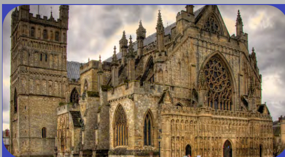
EXETER INCLUDING EXETER CATHEDRAL