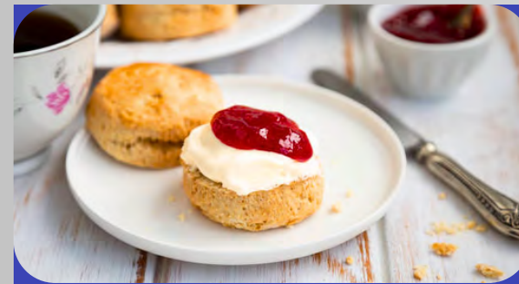
COASTAL WALK AND CREAM TEA AFTERNOON