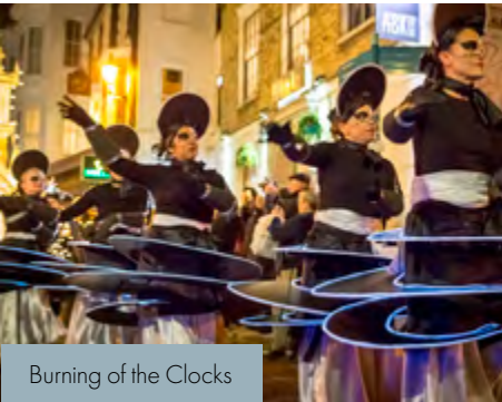
Burning of the Clocks