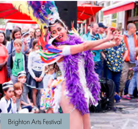
Brighton Arts Festival