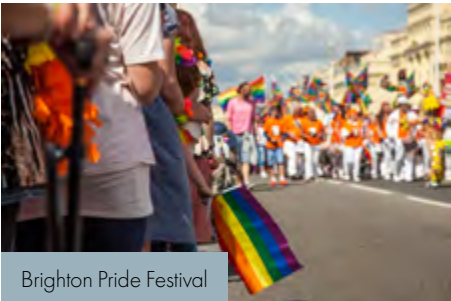
Brighton Pride Festival