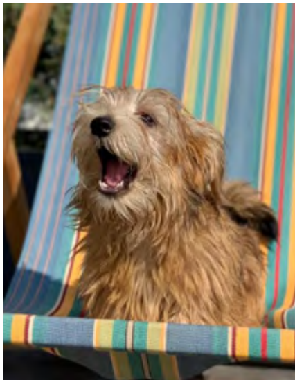
Oscar the school's mascot

BLC International can arrange private taxi transfers for families and for our junior students. These will take families directly to their accommodation on arrival and back to the airport on their departure.