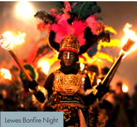
Lewes Bonfire Night