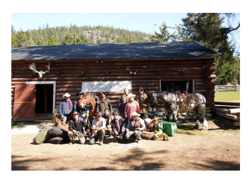
A successful Guide School at the end of their training

Located on the same ranch as our Language School is a Wilderness Guide School. This school offers students a chance to continue their language skills while developing their knowledge of working with horses and the skills required to become a guide in the wilderness. Once our students have had a taste of life on a wilderness ranch this is a natural continuation of their interests.