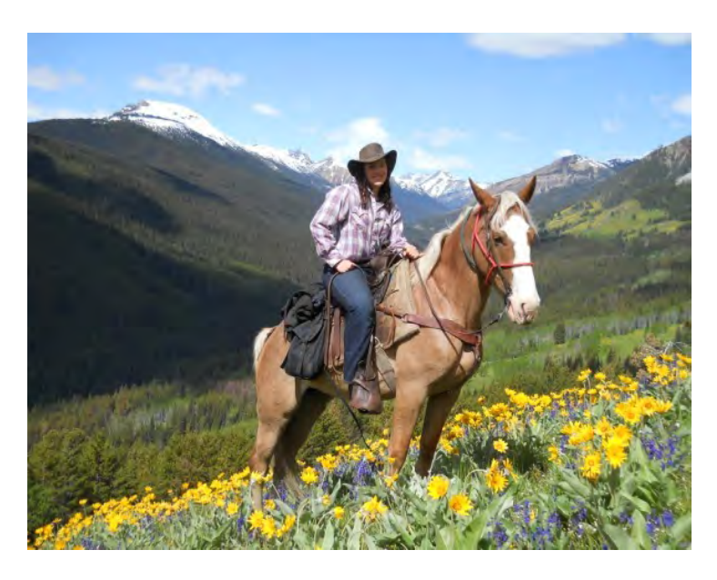
Riding in the meadows

Just being able to ride on a horse on trails through amazing flower covered meadows and along the mountain tops is an experience our students will remember for a lifetime!