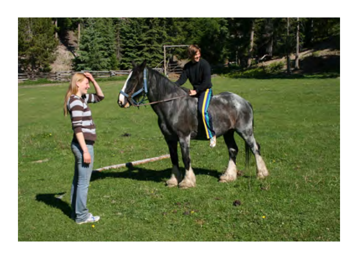
Bareback riding is always popular