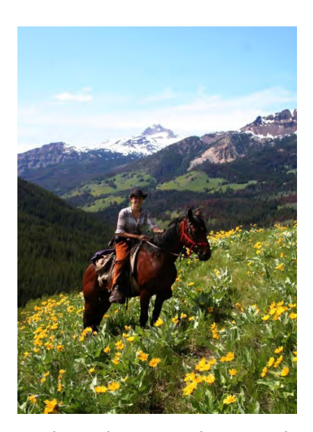
A student riding in an alpine meadow

Here at the ESL Wilderness Ranch we combine a high standard of English language study with the adventure of being on a horse ranch with over 40 horses. The ranch is situated in the South Chilcotin Mountains, deep in the wilderness of British Columbia, Canada. We prefer using the Communicative Language Teaching (CLT) approach. This is the most widely practiced approach to teaching a second language. Our goal is to have our students achieve "Communicative Competence". This means that our students are able to communicate in English using the four language skills, speaking, listening, reading and writing.