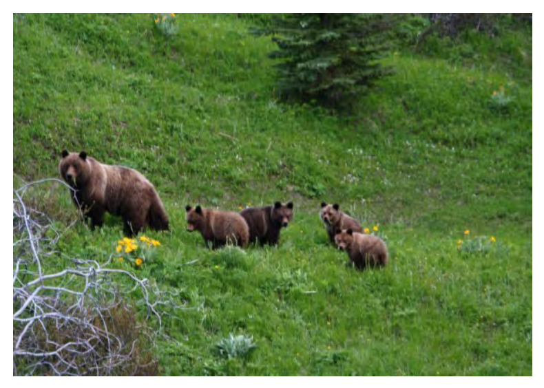
A Grizzly with her 4 cubs in a meadow

On the weekends students can take the opportunity to go on longer horseback rides or take part in some Wildlife viewing. Because of our environment here in the South Chilcotin Mountains, wildlife is in abundance and many students enjoy viewing such rare sights as a Grizzly with four cubs. Some of these extra activities may incur charges.