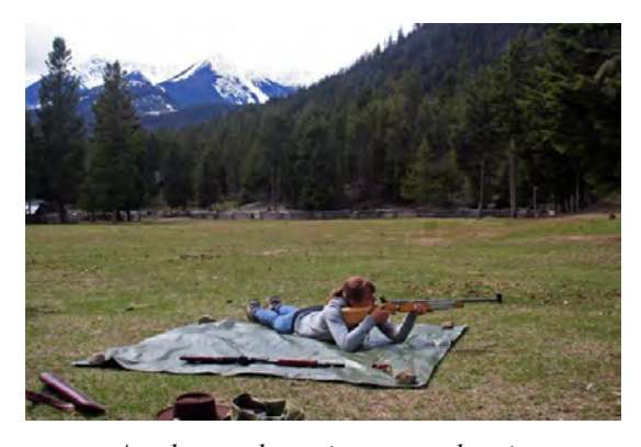
Another student tries target shooting