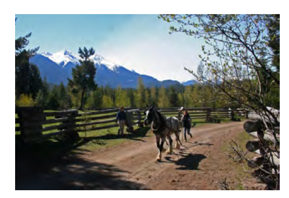
A student learning Long Reigning

Afternoon activities are as varied as they are exciting. Obviously horseback riding is very popular, regardless of any previous riding experience and before we ride on the trails, we give a full orientation into "Western" style riding followed by some time in our Gymkhana to gain experience and confidence. Students also have the opportunity to try many other ranch activities such as target shooting, shoeing horses, driving a Skidder or quad bike, even trying their hand at using a lasso!